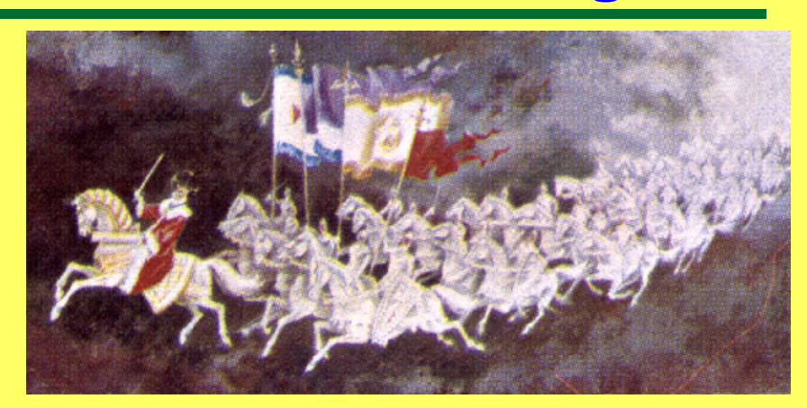
6. Affects all mankind