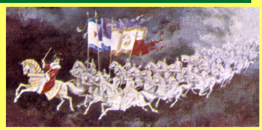
11. Christ comes with His bride