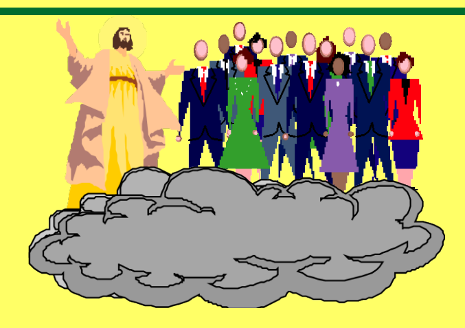
8. No reference to Satan