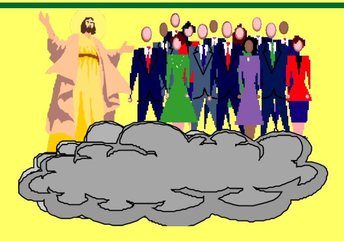
7. Before the day of wrath