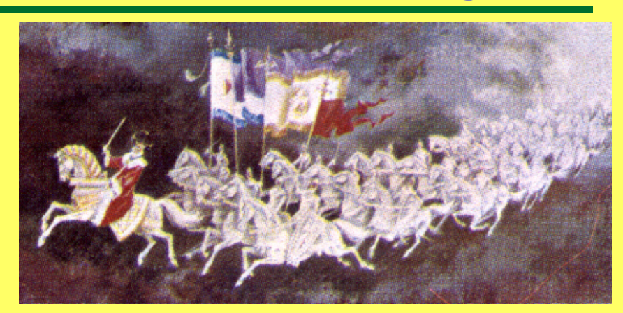
10. Christ comes to the earth