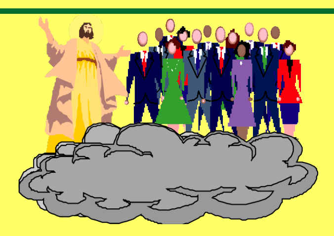
10. Christ comes in the clouds