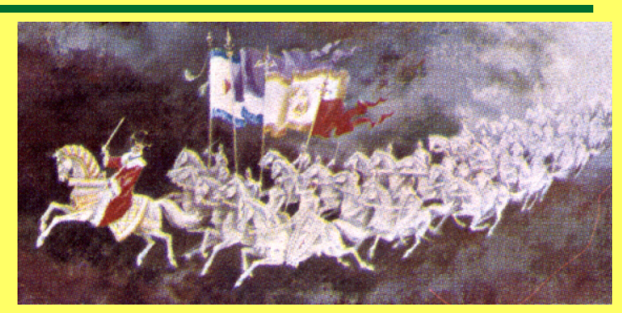
3. Earth is judged and righteousness established