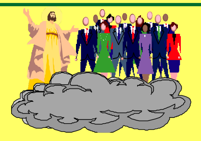
9. Christ comes for His own