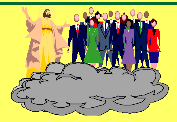
6. Believers only