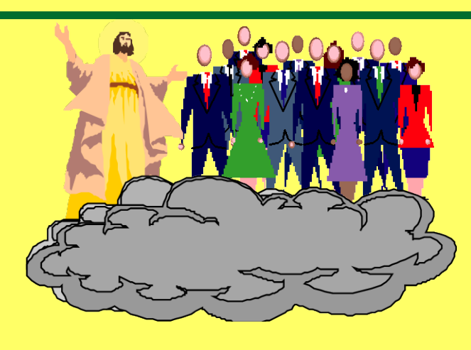
11. Christ claims His bride