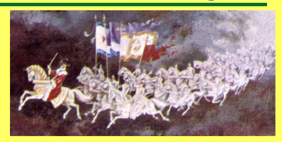
5. Predicted often in the Old Testament