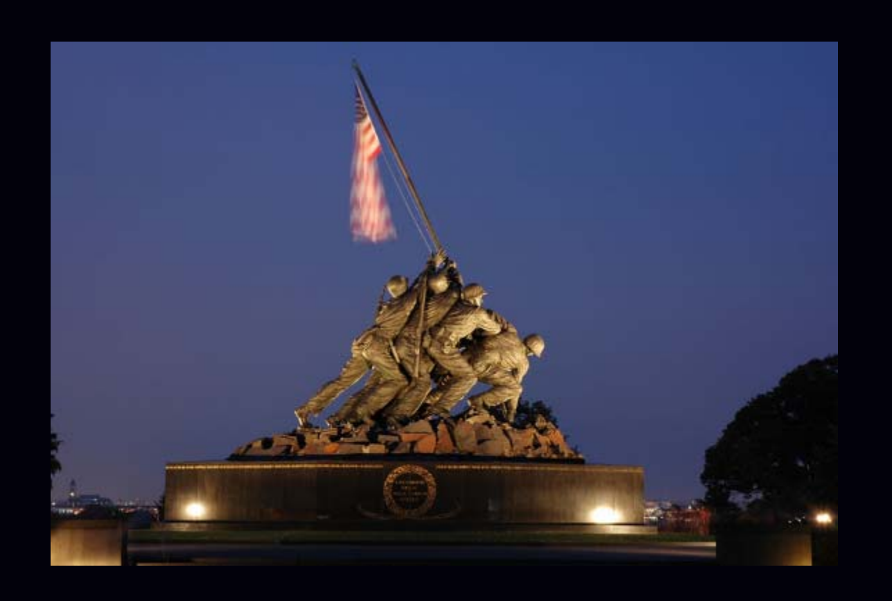
Nov 10, 2007, Happy Birthday USMC