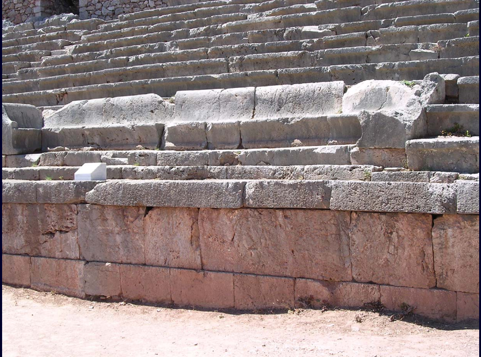
Bema seat for the judges at the Delphi stadium