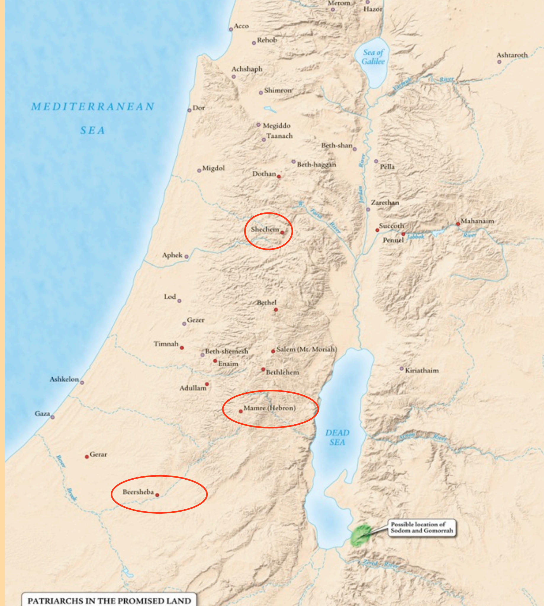
PATRIARCHS IN THE PROMISED LAND