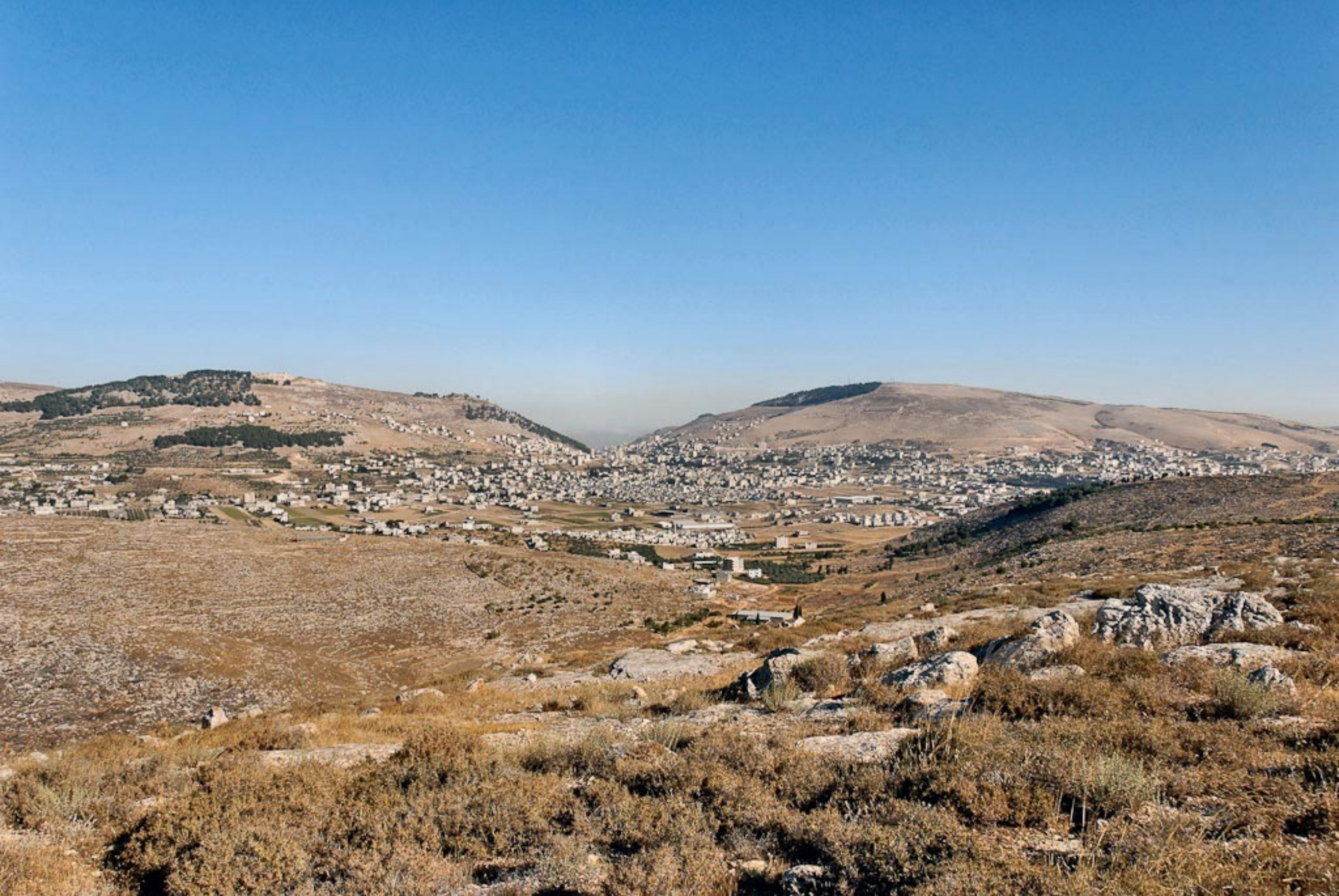
Mount Gerizim, Shechem, Mount Ebal from east