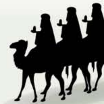
The Magi come to Bethlehem.