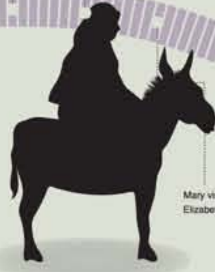
Mary visits Elizabeth.