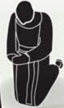
An angel appears to Joseph.