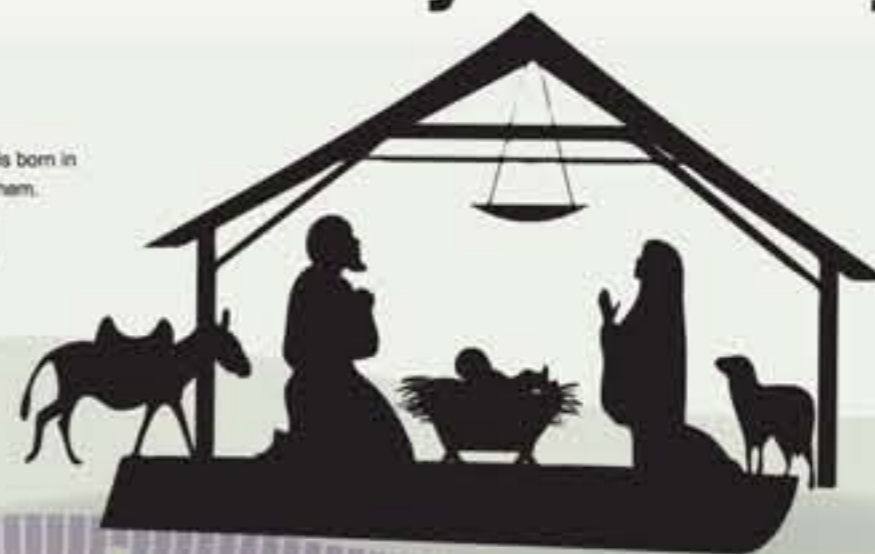
Jesus is born in Bethlehem.