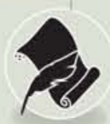
Caesar Augustus decrees a census.