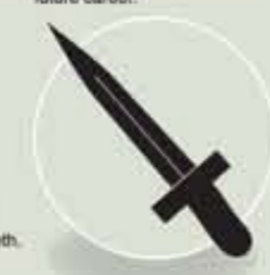
John the Baptist is circumcised. Zechariah prophesies about his future career.