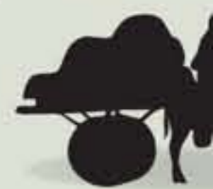
Joseph, Mary, and Jesus flee to Egypt.