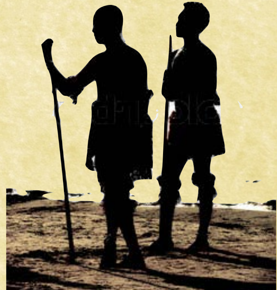
Pagan aborigines; Your neighbor

God the Holy Spirit convincing them of the truth