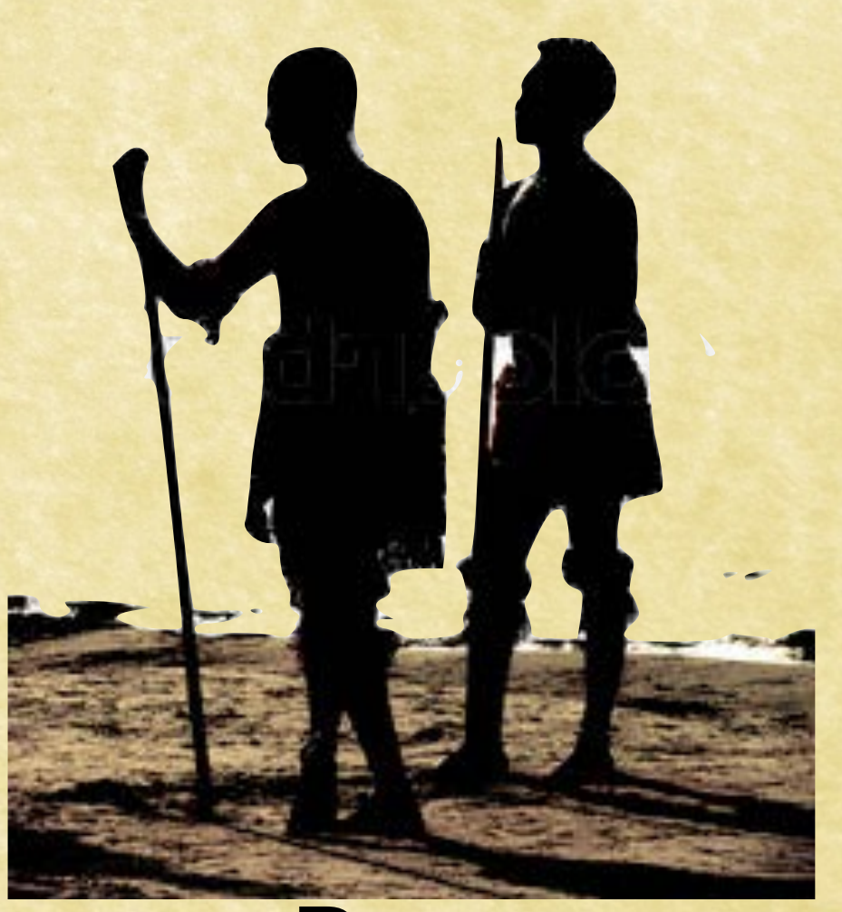
Pagan aborigines; Your neighbor

God the Holy Spirit convincing them of the truth