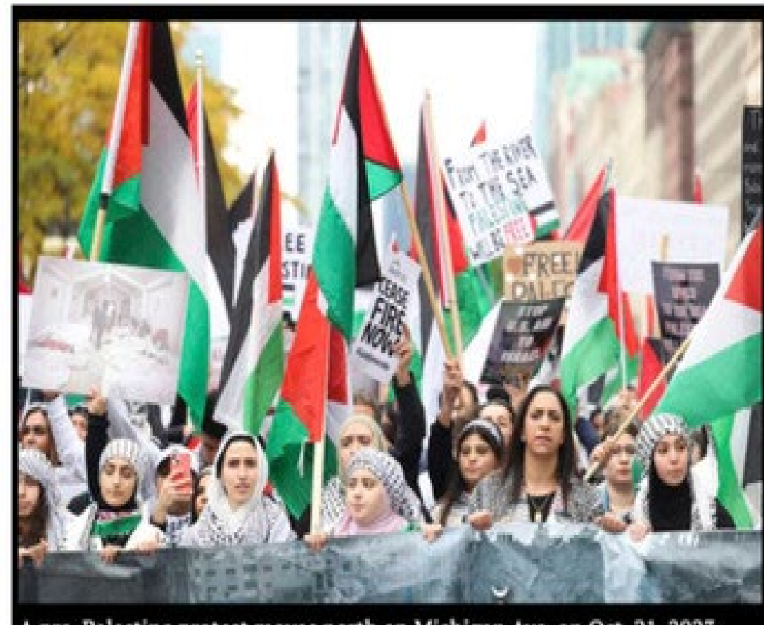
A pro-Palestine protest moves north on Michigan Ave. on Oct. 21, 2023.