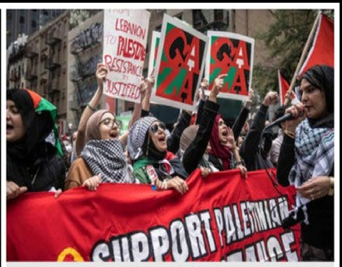
Pro-Palestinian demonstrators marched toward the United Nations on Monday. A pro-Palestinian rally on Sunday led to fierce political backlash.